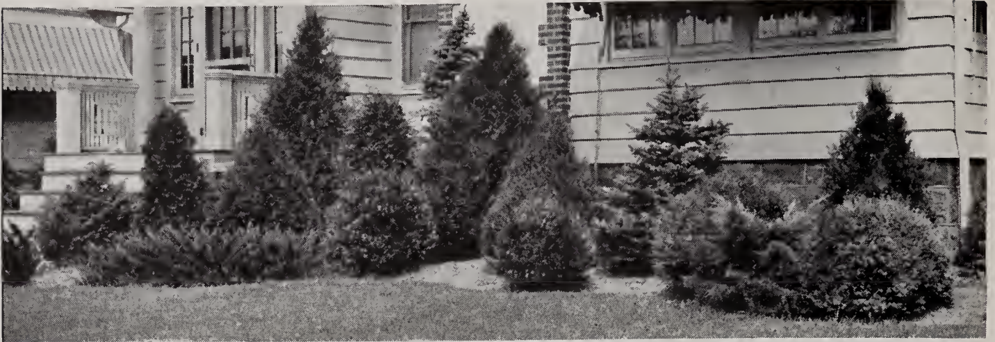
Arborvitæ (back) Prostrate Juniper (front)